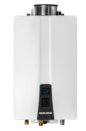
UNIVERSAL - Concentric Direct Vent INDOOR or OUTDOOR (with Vent Kit)