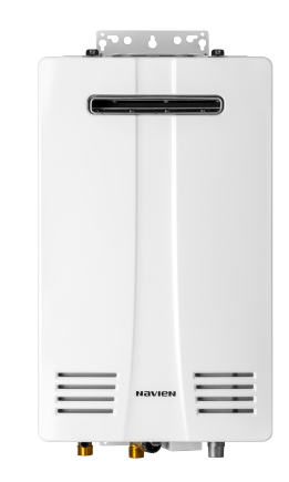
EXTERIOR - Non-Direct Vent OUTDOOR use only