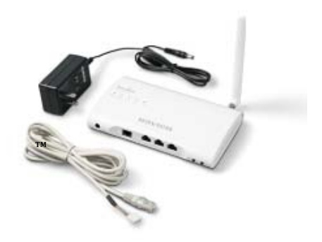
NEW! Remote Wi-Fi Control for Ultimate Home Comfort